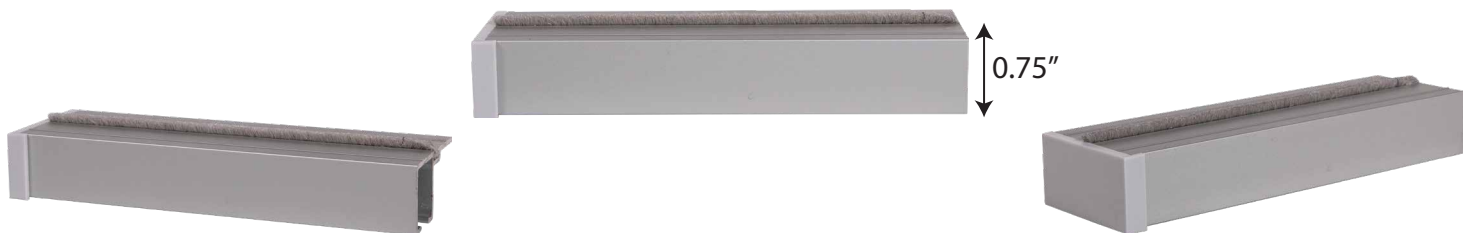
Ceiling Mount Squared 0.75" Model # BP658

*This model is also available in a 1.5" and a 3" size.